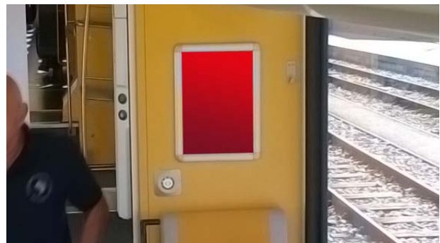
RailPosterMidi 25 x 35 cm